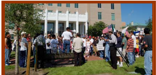
Immigrants march in Downtown Pensacola