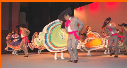
Ballet Folklorico de Mexico performs at Pensacola Junior College

Like its readers, La Costa Latina is a vital part of the community of the Gulf Coast.