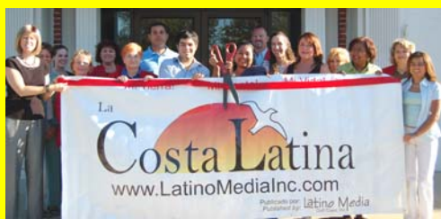
La Costa Latina joins the Pensacola Bay Area Chamber of Commerce

... and we are there for important events!